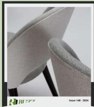
Furniture & Outdoor